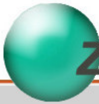
Cat. No. 073